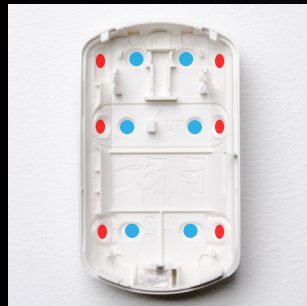
Flexible mounting points