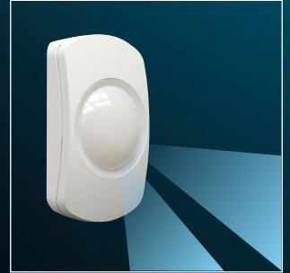
Improved creep zone performance