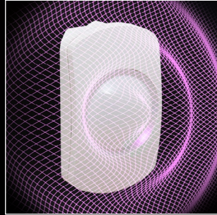
Superior microwave detection