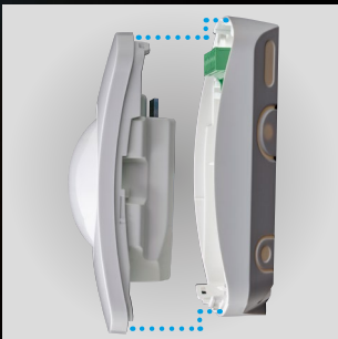
Front-loaded fully sealed electronics

Speed up your installations and spend less time installing devices. Capture has been designed with the installer in mind and includes a host of installer friendly features, making installation and commissioning a doddle.