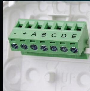
Adjustable terminal block