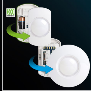
Grade 2 and wireless options