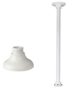
PFA106+PFB220C Adapter Plate + Ceiling Mount Bracket