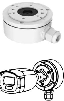
DS-1280ZJ-XS Junction Box